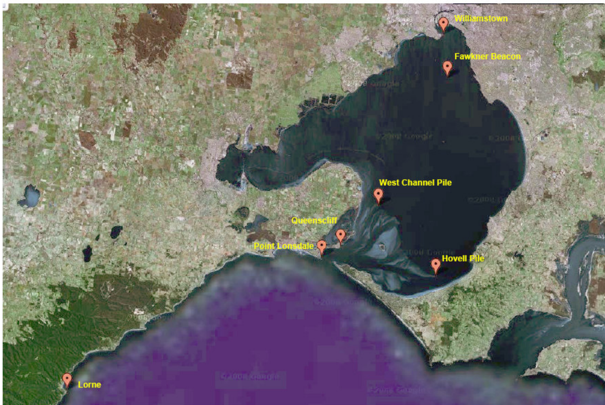
Figure 1. Map of Port Phillip Bay and surrounds with locations of the tide gauges operated by the Port of Melbourne Corporation to be used for the tide height assessment.